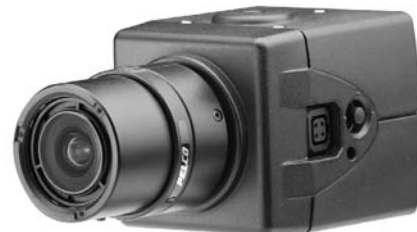
(LENS NOT SUPPLIED WITH CAMERA)

The CCC1380UH is one of Pelco's smallest full-featured digital color CCD cameras. It is designed to provide superior picture quality over a wide range of conditions. The camera's compact size, combined with its numerous features, makes it the ideal camera for most applications.